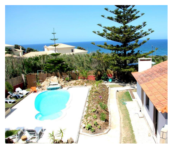
www.starpinelodge.com Colares, Sintra, Portugal

The lodge is exclusively reserved for our group. There is a garden with swimming pool, beautiful indoor and outdoor areas which invite you to stay and relax as well as a communal kitchen and barbecue for free use. The historic town of Sintra, is only about 10 km away. Come enjoy the region on a walk to Cabo da Roca along the Atlantic coast, a stroll through one of the picturesque villages or a visit to one of the magnificent palaces and castles and their gardens.